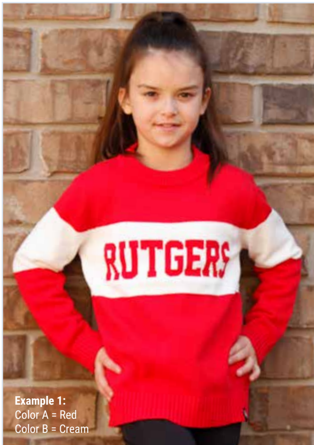
Example 1: Color A = Red Color B = Cream

Features: Long sleeve crew neck, rib trims, bold contrast stripes.