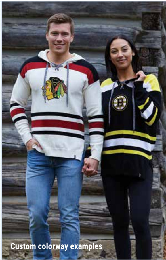
Custom colorway examples