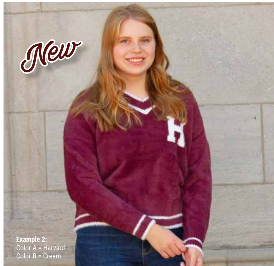
Example 2: Color A = Harvard Color B = Cream

Features: Updated varsity - everyday wear! Vee neck, drop shoulder, roomy fit, varsity stripes.