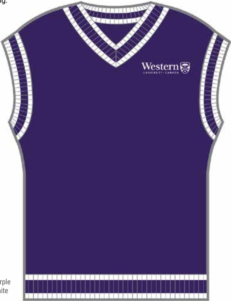
Example 2: Color A = Purple Color B = White