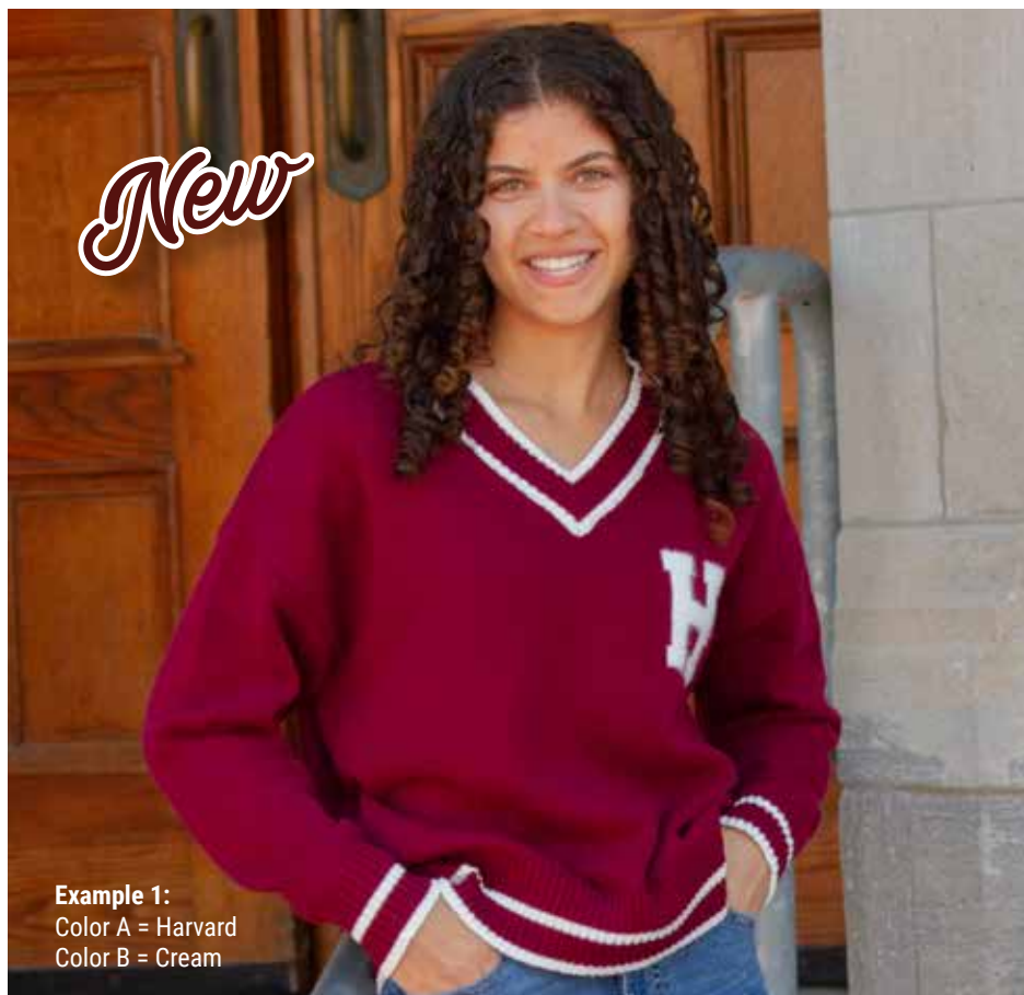
Example 1: Color A = Harvard Color B = Cream

Features: Updated varsity - everyday wear! Vee neck, drop shoulder, roomy fit, varsity stripes.