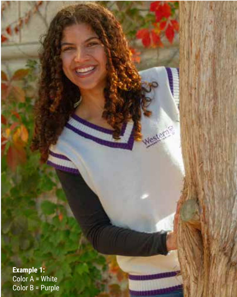
Example 1: Color A = White Color B = Purple

Features: Modern fit - loose and slouchy, wide shoulder, rib vee, armholes and hem, oversize layering.