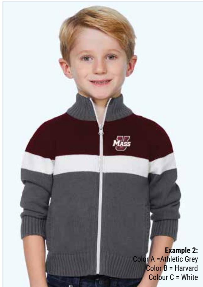
Example 2: Color A = Athletic Grey Color B = Harvard Colour C = White

Features: Color blocked design, mock neck, nylon zipper, pockets.